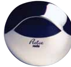
Infra Red Sensor