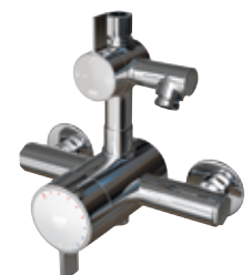
Exposed diverter option for dual shower operation

Contact Sales Office for more information