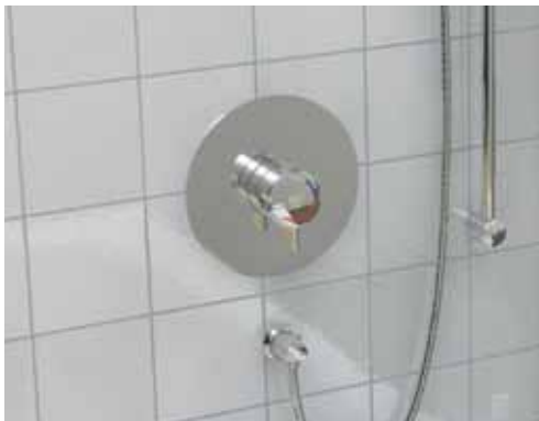
Concealed valve, circular backplate