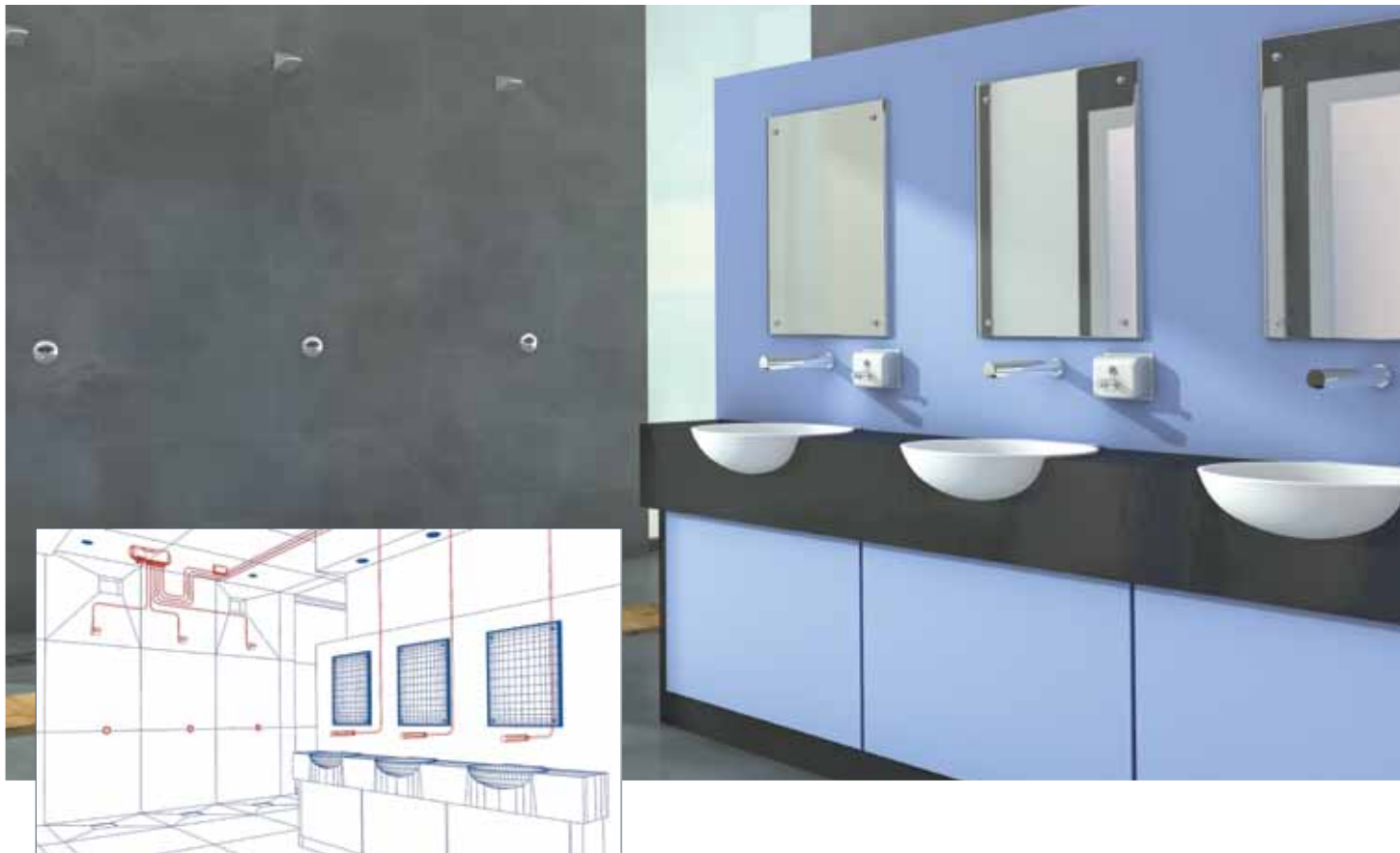
Illustration showing typical installation of valve and pipework for 3 basin and 3 shower system