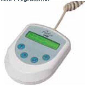
Hand Held Programmer