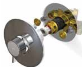
Versatile exposed and concealed options