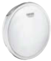
19 025 000 Talento trimset for waste set