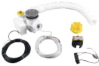
49 113 000 / SH0 Waste set for free standing bath tub