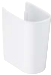
39 570 000 Half Pedestal for wash basins