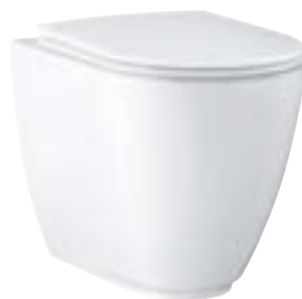
39 573 00H Floorstanding WC back to wall 39 576 000 Seat & cover 39 577 000 Soft close