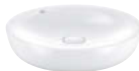
39 609 00H Vessel 45 cm

With Essence you will find all the power, performance and clever details you expect, concealed within an astonishingly slim, sleek, elegantly organic exterior.