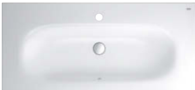
39 566 00H Vanity basin 100 cm 39 567 00H 80 cm 39 568 00H 60 cm