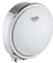
19 952 000 Talentofill trimset for waste set