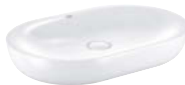
39 608 00H Vessel 60 cm