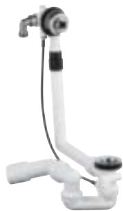
28 991 000 Talentofill inlet waste & overflow valve