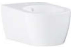
39 574 00H Wall hung bidet