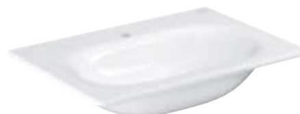
39 564 00H Wall hung basin 70 cm 39 565 00H 60 cm