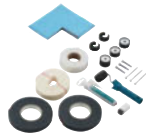
49 114 000 Sealing system