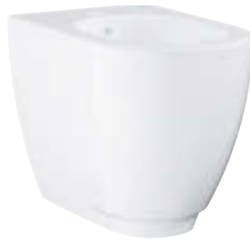
39 575 00H Floorstanding bidet