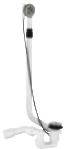
28 943 000 Talento pop-up waste