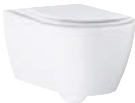
39 571 00H Wall hung WC 39 576 000 Seat & cover 39 577 000 Soft close