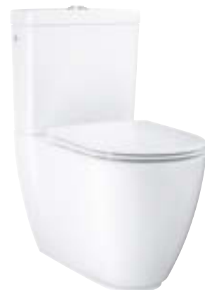
39 572 00H Floorstanding WC 39 579 000 Cistern with bottom inlet 39 578 000 Cistern with side inlet 39 576 000 Seat & cover 39 577 000 Soft close